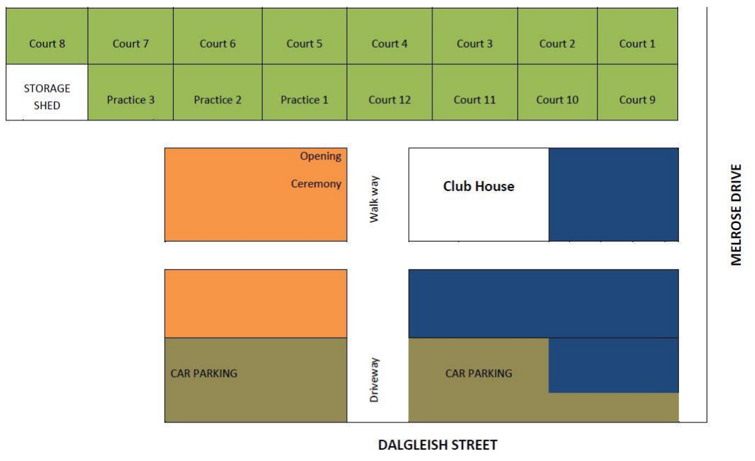
Venue Map – Wodonga Tennis Centre