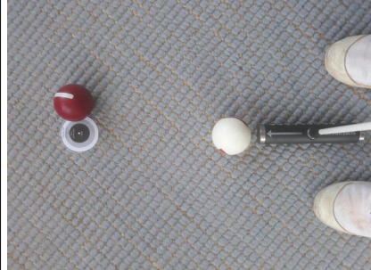
A squarer slide will result when the target is about 1.5 -2 cm from the side of the red ball