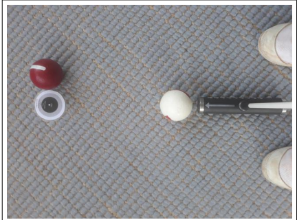
A really long, fine slide will result when the target at the cetre of the ghost ball is about 3 cm from the side of the red ball

Swing. Having stalked the target and adopted a stance a player should focus on the point their stick will strike at the back of the ball. All too often players are distracted by the target ball and twist their stick towards it. Another common error is to stab at the ball and not swing.