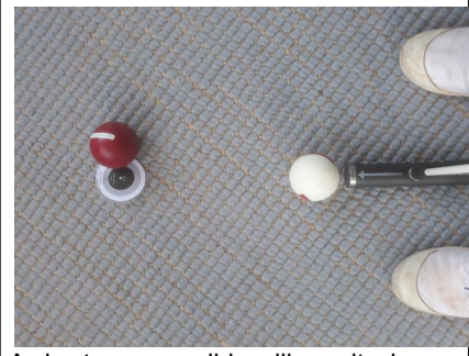
A short squarer slide will result when the target is about 1cm cm from the side of the red ball