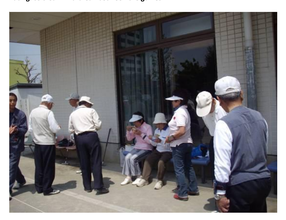
Eating ice cream in a break between the games