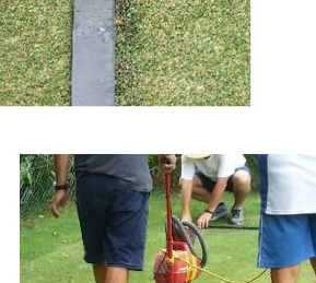
Roll out the conveyer belt